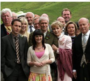
Series 7 cast Photo.