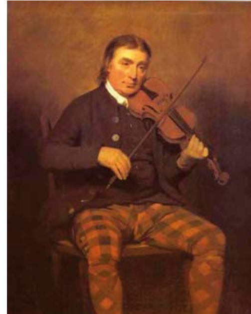
The famous Scots fiddler NEIL GOW—his portrait hangs in Blair Castle. He met Robert Burns there in September 1787. Gow composed the tune “Loch Erich Side” which Burns used for “Address to the Woodlark”.