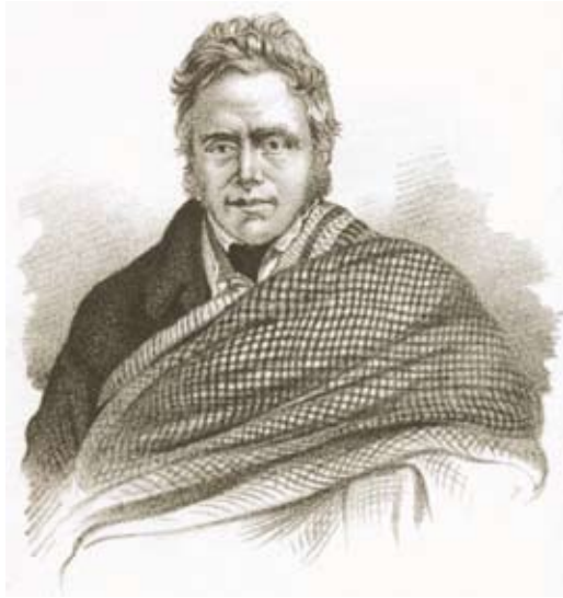
JAMES HOGG—“ The Etterick Shepherd ” a famous Scots songwriter, poet and novelist, who followed in the footsteps of his hero Robert Burns. In 1803 he literally followed as far as the hills, overlooking Loch Ericht towards Ben Alder, whilst staying at Dalnacardoch Inn where Burns also visited.