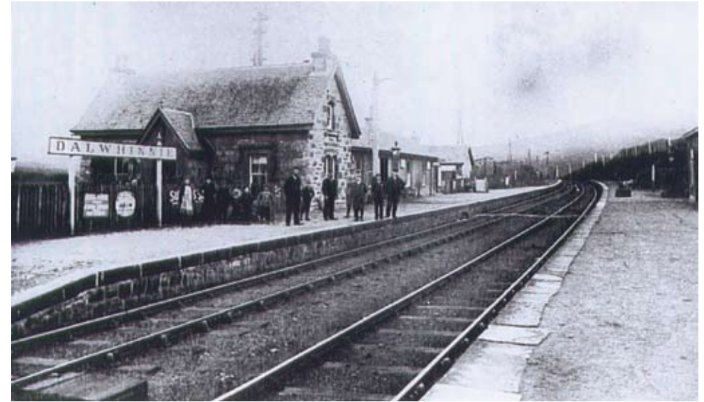
Early photograph of Dalwhinnie Station looking South. The main building shown was burnt down in 1927.