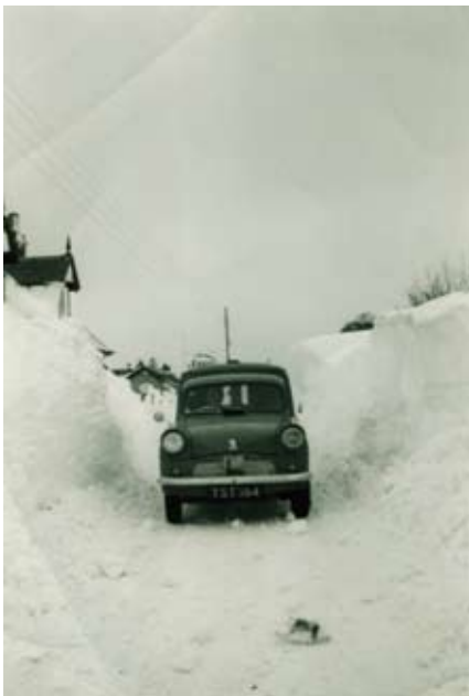
A vehicle leaving the Grampian Filling Station in wintry conditions, 15th February 1963.