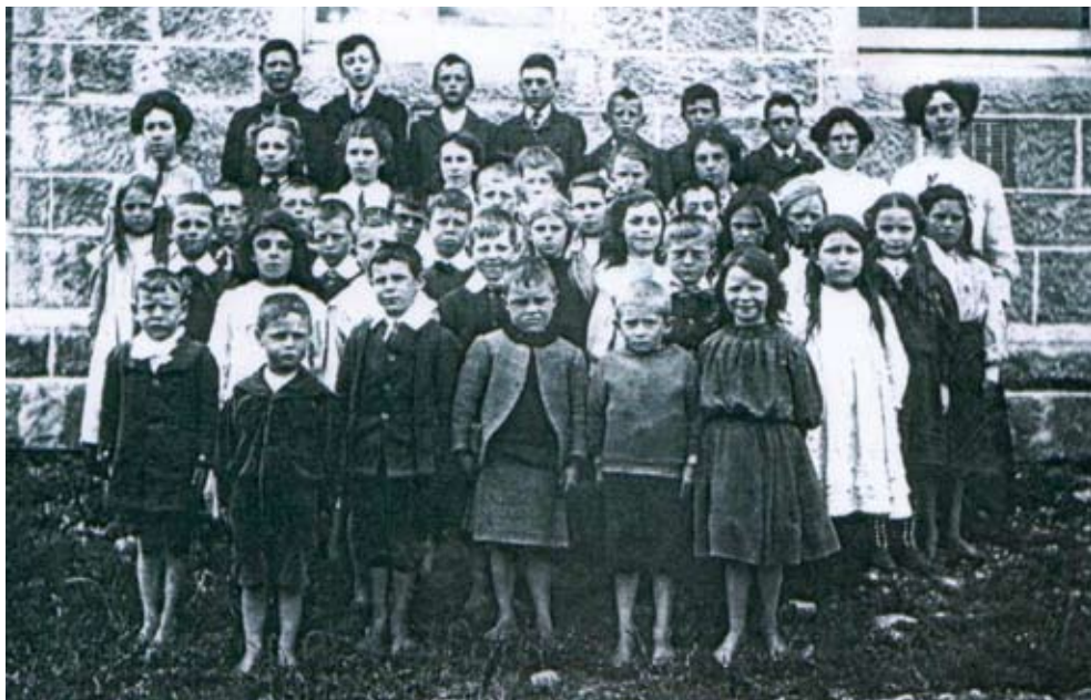
DALWHINNIE SCHOOL pupils in 1908, some being barefoot—it could not have been winter.