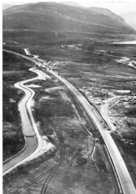
Aerial photograph of the Dalwhinnie by-pass (A9) under construction in 1976.