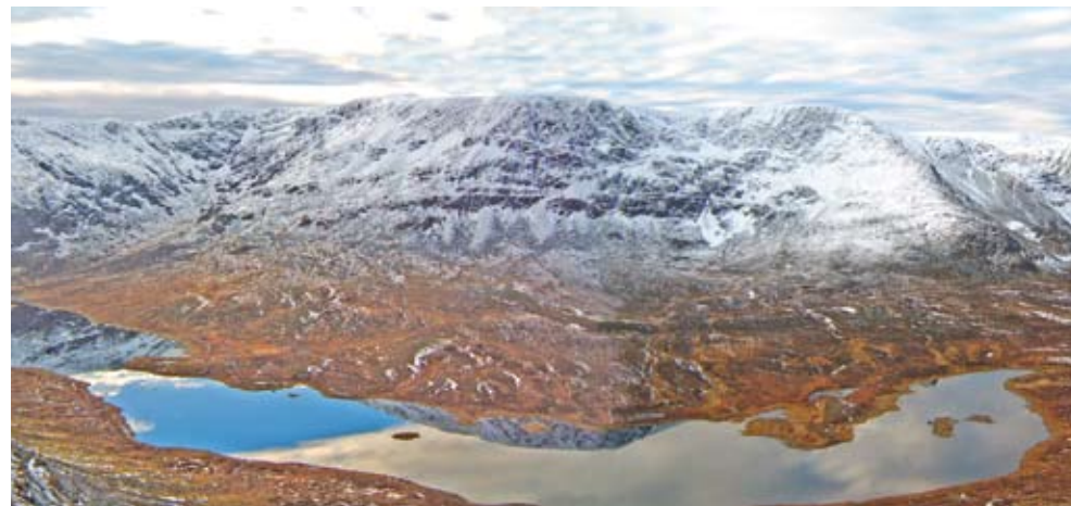
View of BEN ALDER from Beinn Bheidil