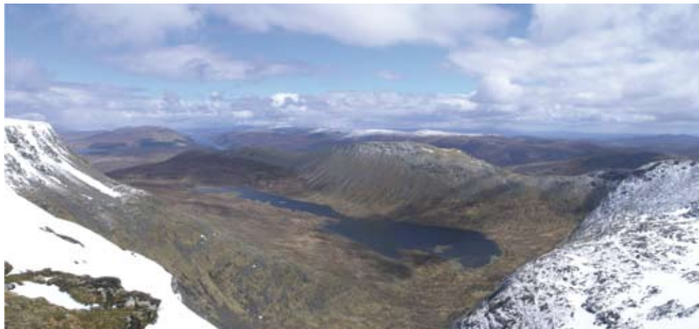
View from Ben Alder. In the foreground Loch a' Bhealaich Bheithe and beyond it Loch Ericht and 12 miles away, Dalwhinnie.