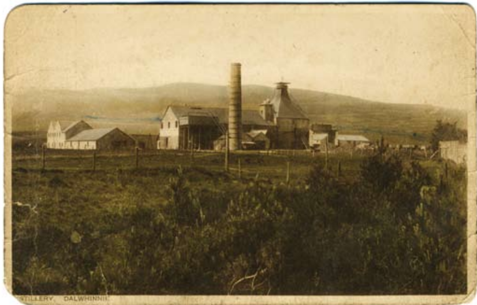
THE DISTILLERY after the fire. Note the piles of rubble to the left of the buildings. The Distillery was closed for 4 years whilst being rebuilt, and reopened in 1938.