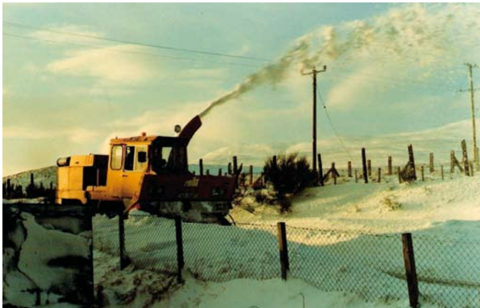
A snow blower clearing Ben Alder Road.