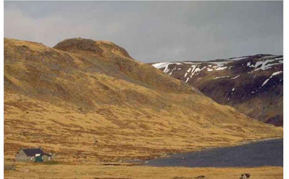
At the foot of An Dun can be seen McCook's COTTAGE, before the extension was built.