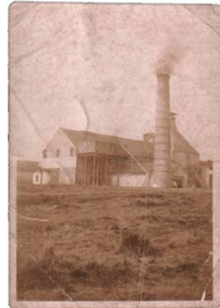
The earliest picture of DALWHINNIE DISTILLERY. It was built in 1897 and originally named Strathspey Distillery until it was opened a year later.