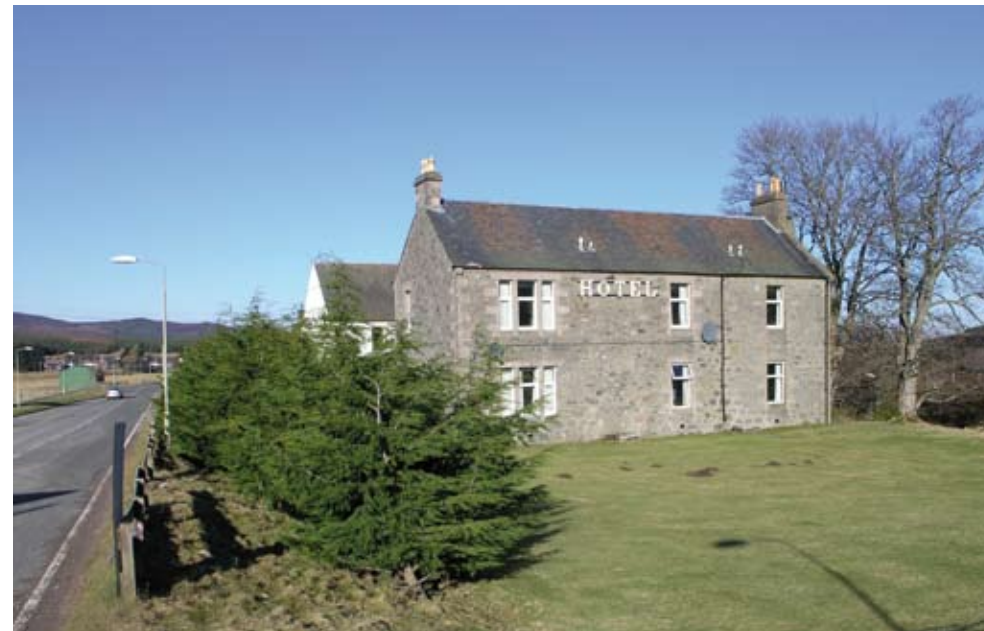
View from the South. The stone building is the original building and was built by General Wade in 1729. There have been many famous visitors including Queen Victoria and Robert Burns. On spending the night of 25th April 1770 at Dalwhinnie John Wesley declared the inn “the dearest Inn I have met with in the North”. During the same night 3 women were smothered in a snow drift crossing to Blair Atholl.