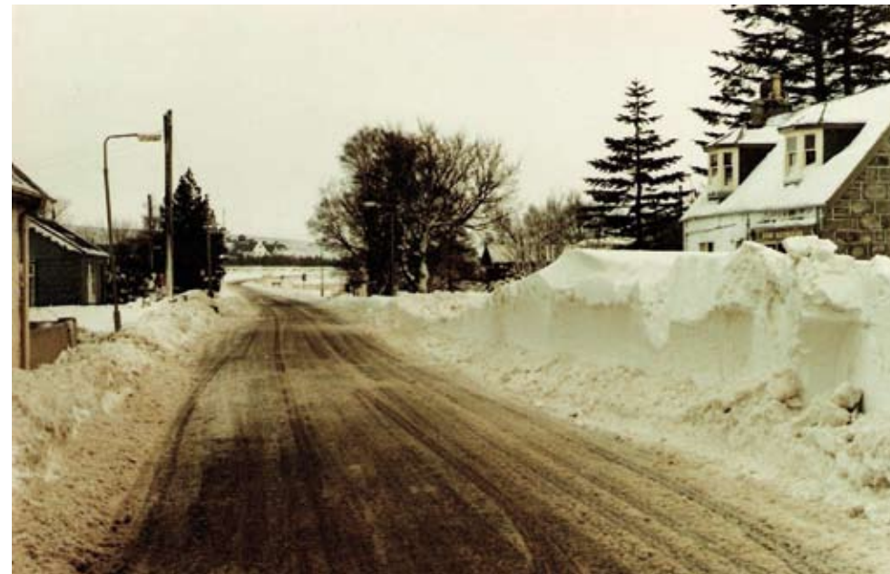
Great North Road through Dalwhinnie in winter (snow drift outside MacPherson's shop).